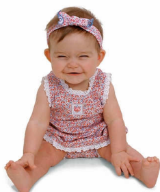
Live Births by Age and Race of Mother, Berrien County Residents, 2005